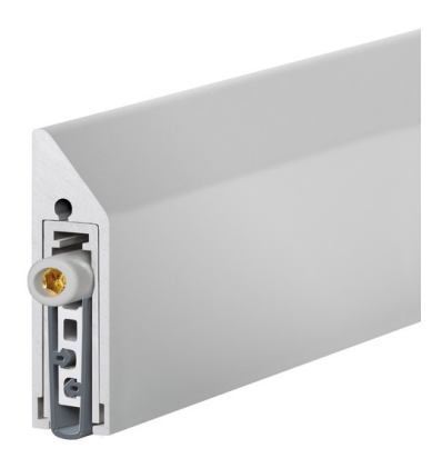
Planet KG-S narrow, release side