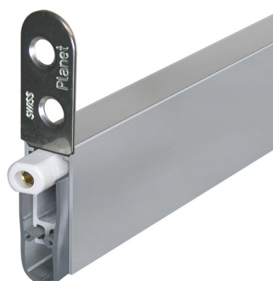
Planet HS, release side