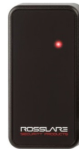
Figure 1: AY-K6255

The reader is approved by the Institute for Science and Halacha for use on the Sabbath.