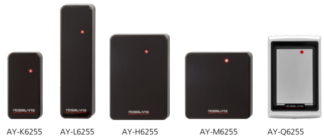
Figure 1: AY-x6255