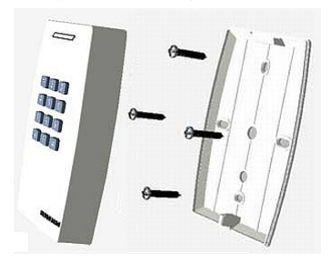
Figure 1: Removing Back Cover